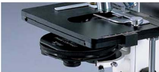
Phase Turret Condenser