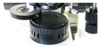
Polarizer in Swing out mount